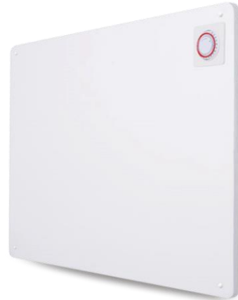
Living & Co and Ecosaver branded Fibre Panel Heaters

DEFECT: The heater may overheat and fail